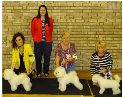
BB. RBB, BPB