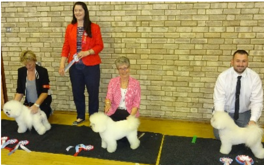
BD. RBD. BPD