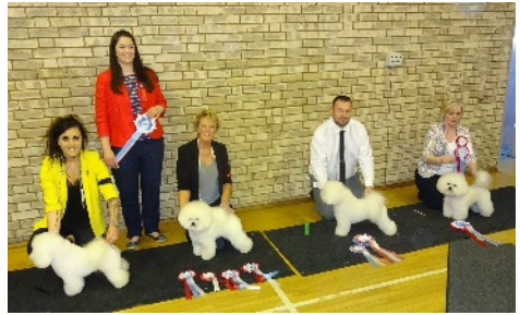
BIS. RBIS. BPIS. BVIS